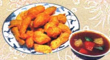
C1. Sweet & Sour Chicken