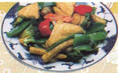
V1. Vegetables Delight with Tofu