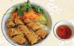
K. Egg Roll over Chills Rice Noodle Salad