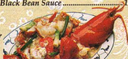
S1. Fresh Lobster with Ginger & Onion