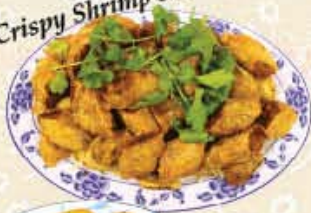
S14. Crispy Shrimp Roll