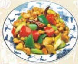
C3. Kung Pao Chicken