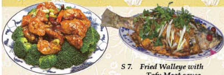
S 7. Fried Walleye with Tofu Meat sauce