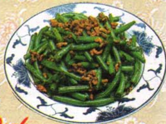
P12. Pork with Green Beans