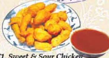
C1. Sweet & Sour Chicken