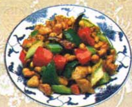
C3. \text{ㄆ} Kung Pao Chicken