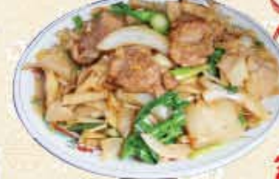
S1. Fresh Lobster with Ginger & Onion